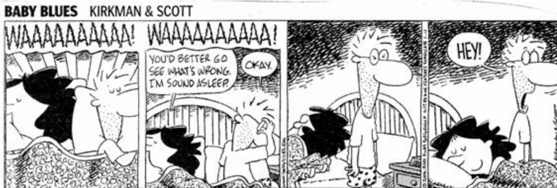
Copyright Baby Blues Partnership. Reprinted with Special Permission of King Features Syndicate